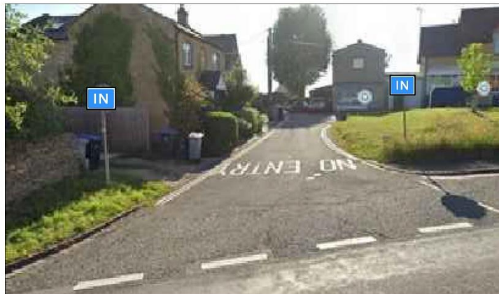
Additional entry signs (optional)