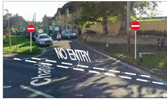
New No entry signs and road markings